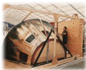
All Systems "GO": A specialized team from Emery Worldwide prepares and crates this 18,000-pound, 14-foot long Apollo 13 command capsule for shipment from Los Angeles to London.

For customized security, handling, and delivery of aerospace and defense cargo, call on our experienced Aerospace Industry Group. And for help in coordinating the complex logistics of your next exhibit, contact our Trade Show and