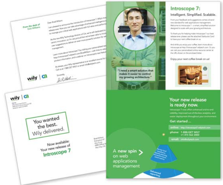
See below to view the envelope, letter, and brochure in this package.

And to provide more information on the technology, the brochure also includes die-cut wheel that spins to match up new features with new benefits.